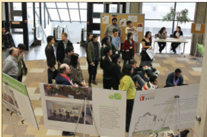
Photo taken at GIS Day at York University.

The CIG Toronto Branch represents the members of CIG in Toronto and its surrounding areas. The current Branch Directors are from universities, government agencies and private industry. The Branch currently has 104 active members. The objectives of the Branch are in line with those of the CIG National association, as stipulated in its bylaw, and include: